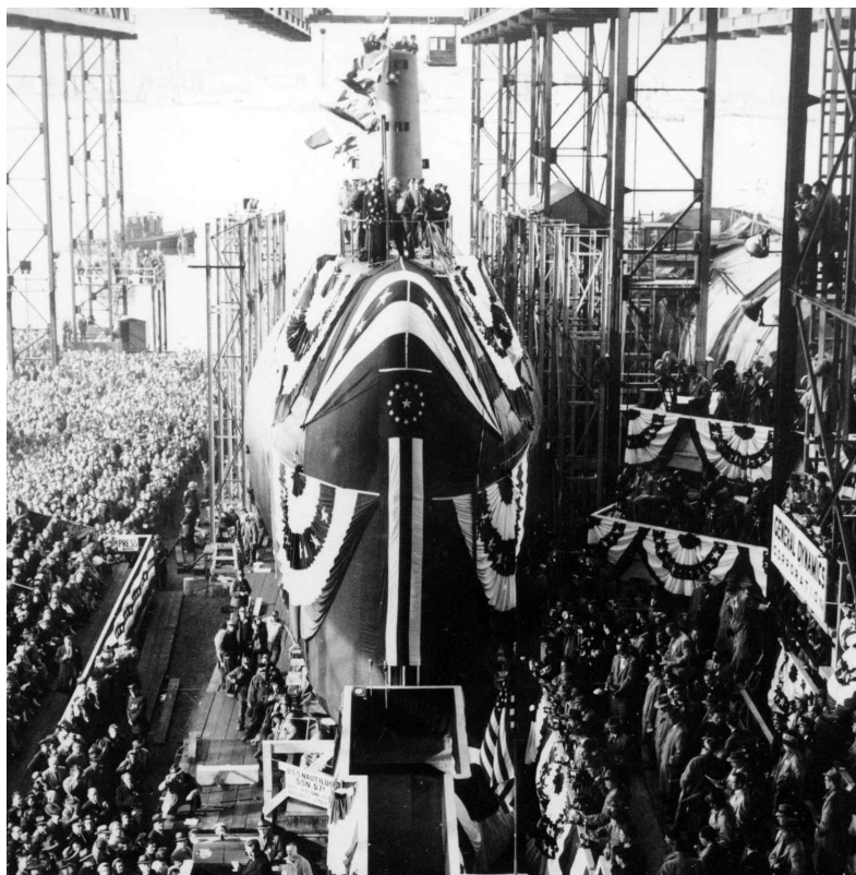
The Nautilus (SSN-571) is decked out in her ceremonial bunting. The Seawolf (SSN-575) is under construction on the right.