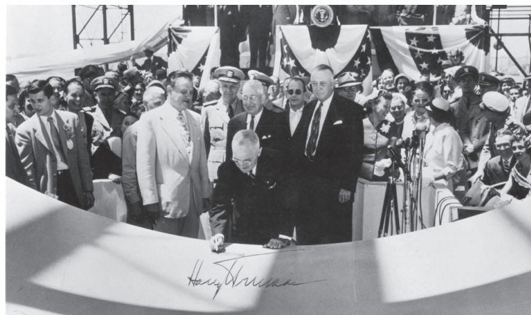
President Harry S. Truman authenticates the keel of the Nautilus (SSN-571) at her keel laying ceremony at Electric Boat, Groton, CT on June 14, 1952.

The Nautilus ship length is 320 feet with 28 foot beam, and displaced greater than 3000 tons of water. Her performance in the first two years exceeded the most optimistic hopes of operation including remaining submerged for over 265 hours, and averaging submerged speeds in excess of 20 knots thanks to her unique power plant. The habitability of the crews living quarters and recreational areas were designed