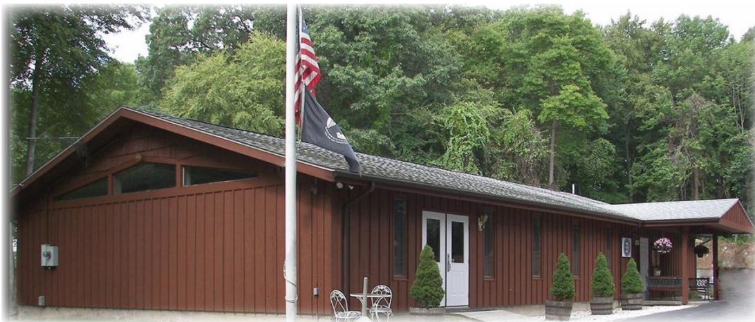
MDA-UAW Local 571 Union Hall, 394 Toll Gate Rd, Groton, CT 06340 (860)448-0552