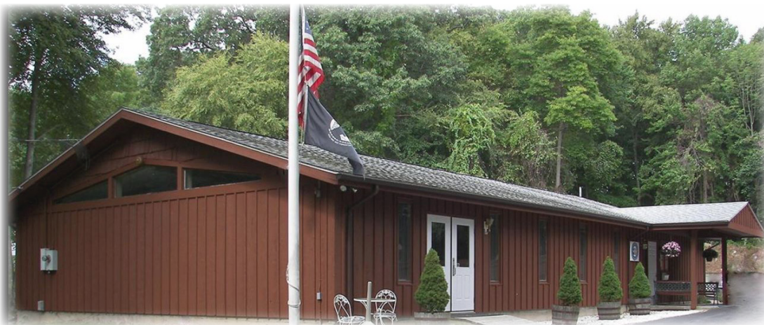
MDA-UAW Local 571 Union Hall, 394 Toll Gate Rd, Groton, CT 06340 (860)448-0552