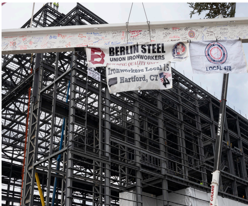
Electric Boat celebrated the topping off milestone for its South Yard Assembly Building on March 10, 2022, when the last beam was placed atop the structure.