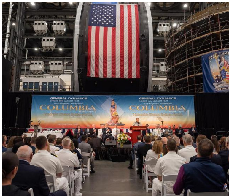
Electric Boat marks the laying of the keel of the submarine District of Columbia (SSBN 826) on June 4, 2022, in North Kingstown, R.I.