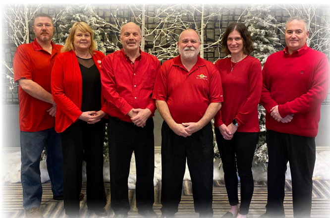
2023 Executive Committee