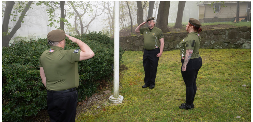
MDA Color Guard raises the flag at Workers Memorial, Washington Park, April 28, 2023.