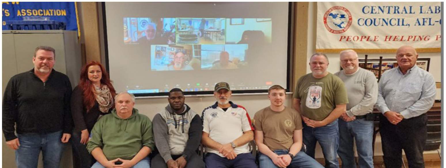
MDA-UAW Region 9A Veterans Council