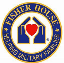
$2000 donation to the CT VA Fisher House

The MDA-UAW Local 571 recently donated $23,385 to 15 Veteran Organization's from proceeds raised at the 2023 MDA Veterans Committee Cornhole Tournament and the sale of Veteran Committee challenge coins along with the MDA retirees monthly donations. We can't thank Foxwoods enough for their support and for hosting us! We also want to thank Coastal, Thompson Speedway & Epicure Cornhole groups for their support in running the event and providing boards, stands and the electronics.