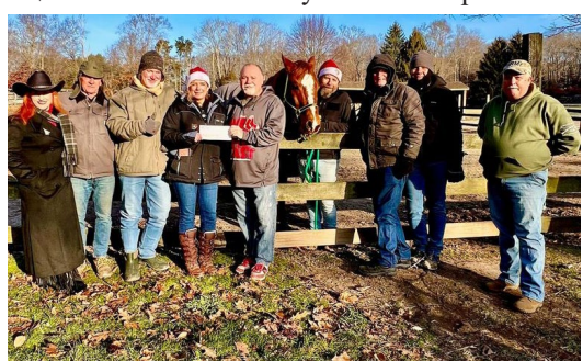
$2000 donation to Veterans Equine Therapy