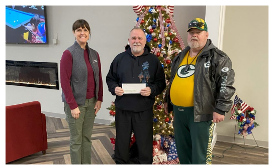
$2050 donation to Vet Rally Point