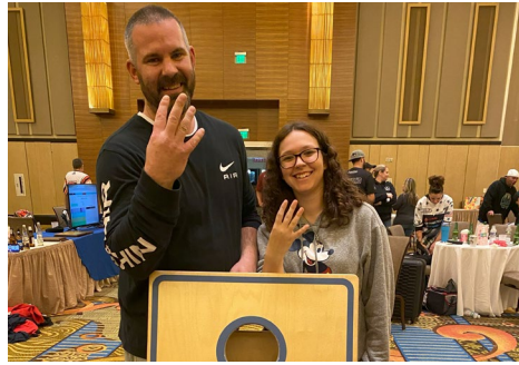
4 TH PLACE