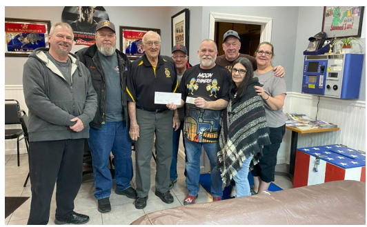
$2000 donation to American Legion Post 91