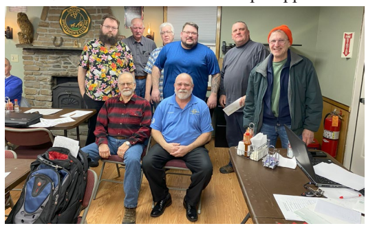
$1000 donation to Groton Gun Club