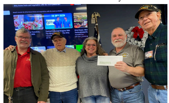
$1000 donation to Willimantic Community Ctr