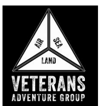
$1000 donation to the Veterans Adventure Group