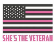
$1185 donation to She's the Veteran Org