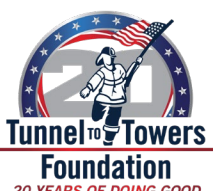
$2000 donation to the Tunnels to Towers, NY