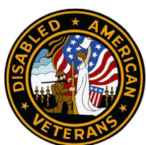
$2050 donation to the Disabled American Veterans