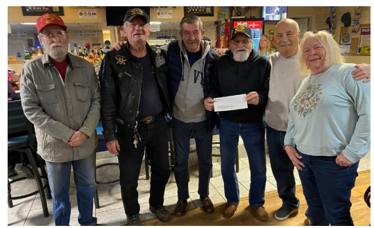
$1000 donation to American Legion Post 112