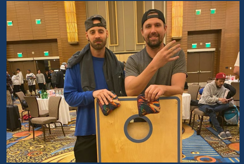
4 TH PLACE