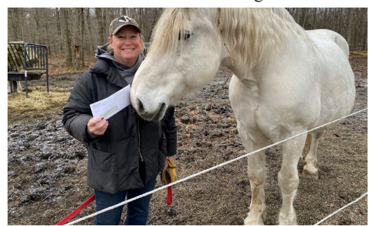
$1000 donation to Dare to Dream