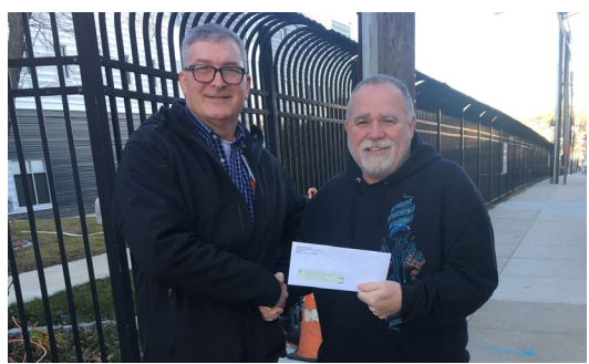
$2050 donation to EB Troop Support