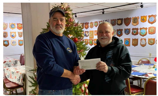
$2050 donation to Groton Sub Vets