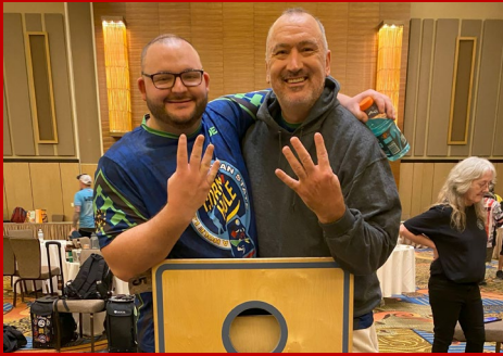
4 TH PLACE